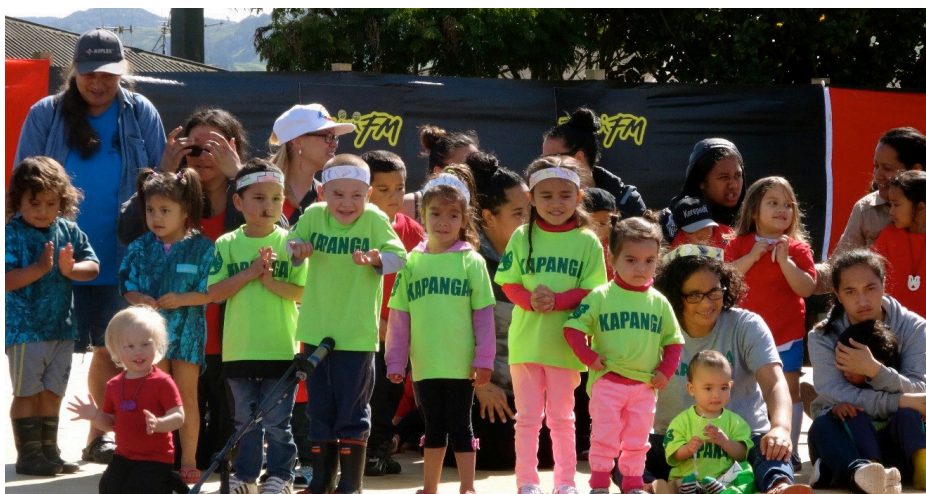
Kapanga Te Kōhanga Reo