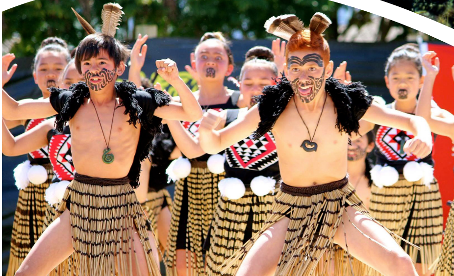
Te Wharekura o Manaia - Juniors