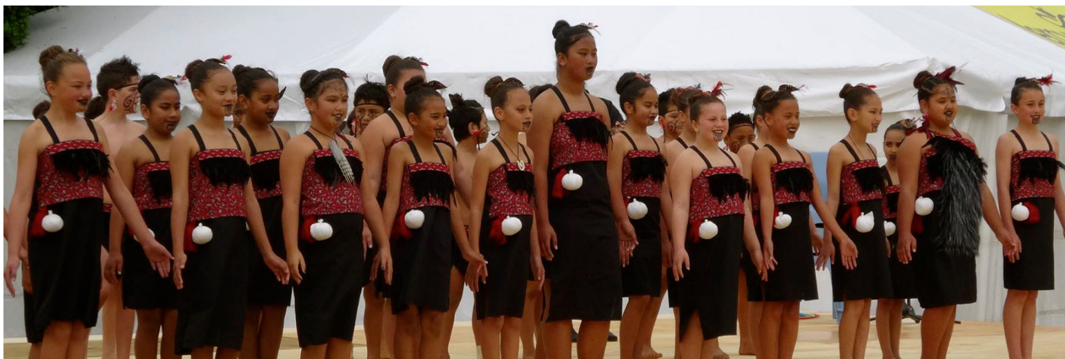
Waihi Central School - Juniors